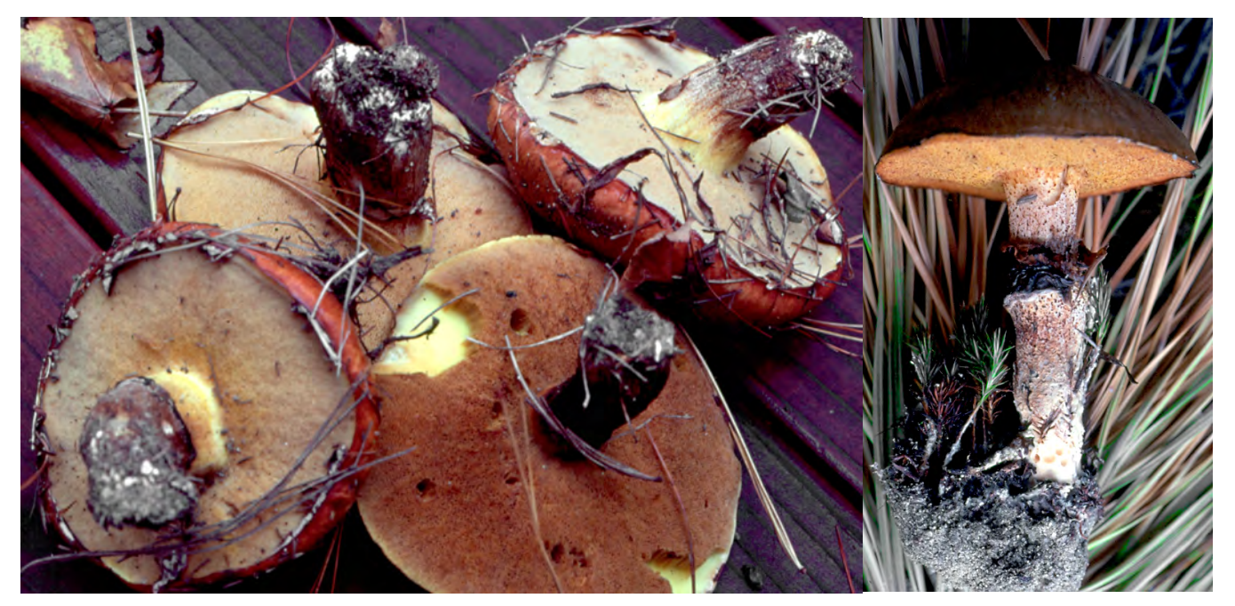
Fig. 12. Slimy topped species of Suillus . Poisoning problems with such species of Suillus appear to be related to failure to remove the slimy skin. On the left is Suillus luteus , and on the right is Suillus salmonicolor which is particularly common in the New Jersey Pine Barrens.

Note: Frequency of poisoning unknown in region of interest. The genus occurs commonly in the region of interest and is collected for food in this area.