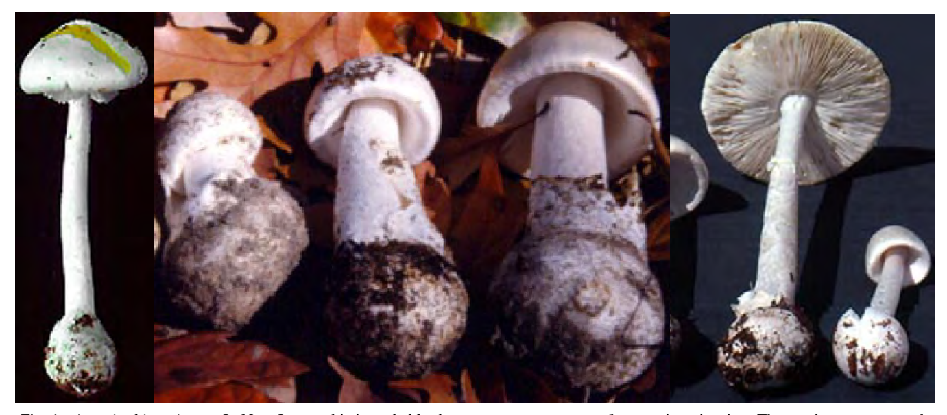
Fig. 1. Amanita bisporigera. In New Jersey, this is probably the most common cause of amatoxin poisoning. The mushroom commonly occurs in forests and with trees in yards (especially oaks and conifers). Perhaps, the white color and frequent occurrence of the mushroom in groups calls attention to it. As it ages, it develops a distinct odor suggesting carrion; this may be why dogs may occasionally attempt to eat it. A drop of 5-10% KOH solution on the cap will produce a dramatic yellow color. While this is NOT a test for a toxin, this test ONLY works on Amanita bisporigera and some other white "destroying angels." A small dropper bottle of 5-10% KOH solution and a mobile phone camera can rapidly convey important information on a potentially deadly toxin to NJPIES who can have an identification confirmed quickly by a mycologist. Nevertheless, the most important questions to ask in all cases of suspected mushroom poisoning are ALWAYS: "When was it eaten?" "When did symptoms begin?"