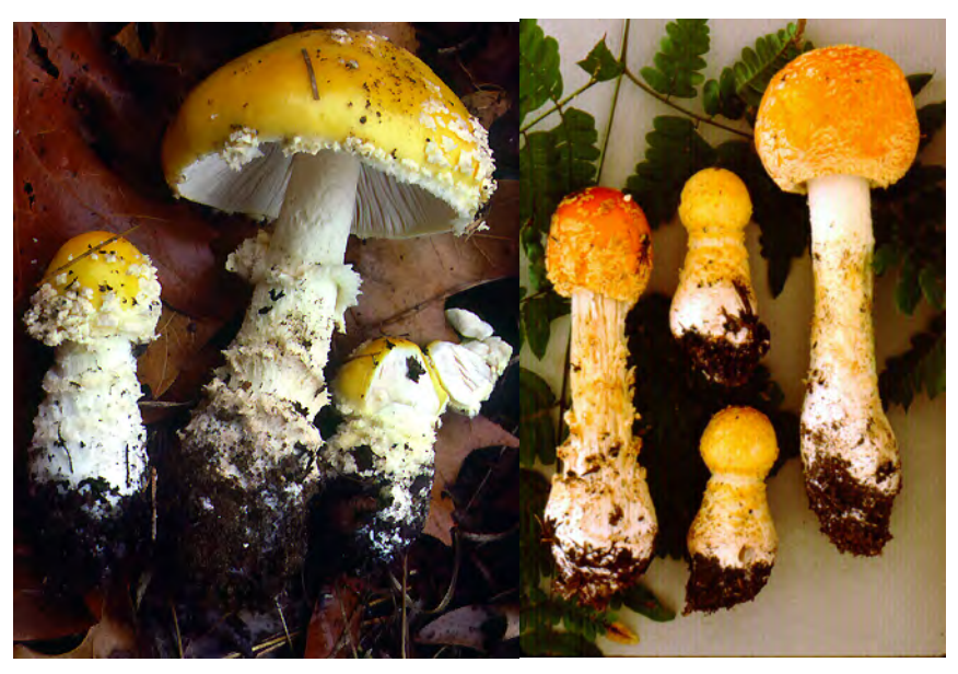
Fig. 5. Yellow color variant of Amanita muscaria subsp. flavivolvata . Ingestion can cause severe cases of the Pantherine Syndrome. Commonly occurring with conifers in the fall, but may occur throughout the mushroom season (approximately May to November to New Jersey).

to death in an adult male. The Euro-asian A. muscaria is used by shamans who say that it is deadly if more than 13 dried fruiting bodies are eaten. (Wasson, 1968).