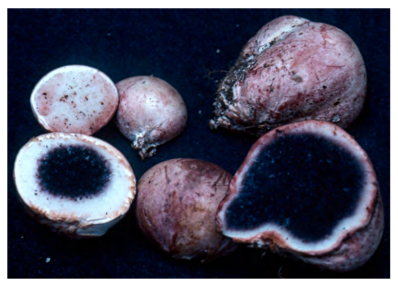
Fig. 13. Scleroderma cepa. The fruiting body is small enough that a child may place an entire specimen in her mouth. The cross-sections show the thickened skin typical of Scleroderma and the typical maturing of the whitish interior to deep purple as spores develop within the puffball.