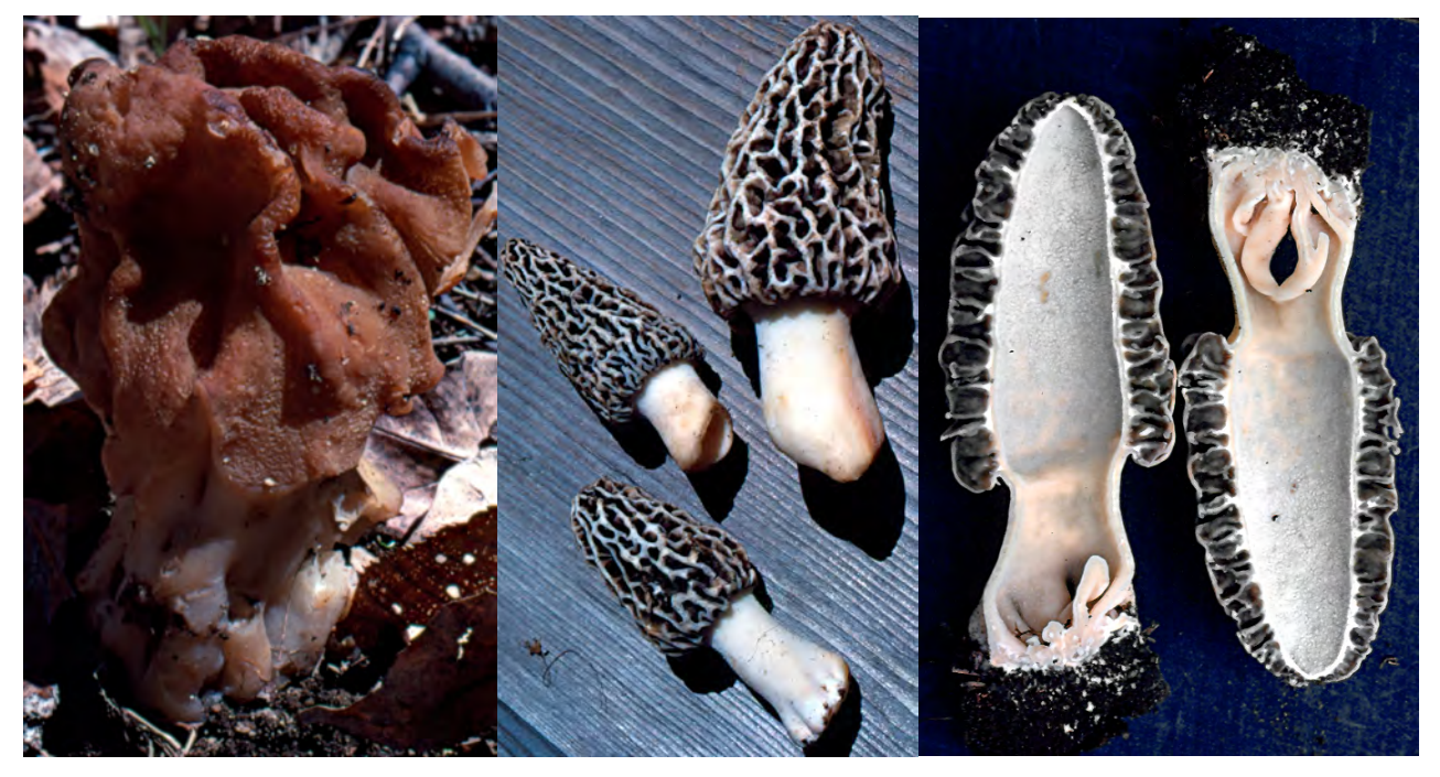
Fig. 3. Gyromitra and Morchella . Species of Gyromitra (left) often have a convoluted exterior appearance and are not entirely hollow. Species of Morchella (center and right) often have a honey-comb-like exterior appearance and are entirely hollow.

The toxin known as gyromitrin becomes monomethylhydrazine (rocket fuel!) in the human body. It is volatile, and people have been known to be poisoned by it because they removed the lid from a cooking pot of false morels (in the genus Gyromitra ) and sniffed the vapors. Dogs have been killed by eating leftovers, when the humans who ate the original meal were not noticeably affected by the toxin. The human body,