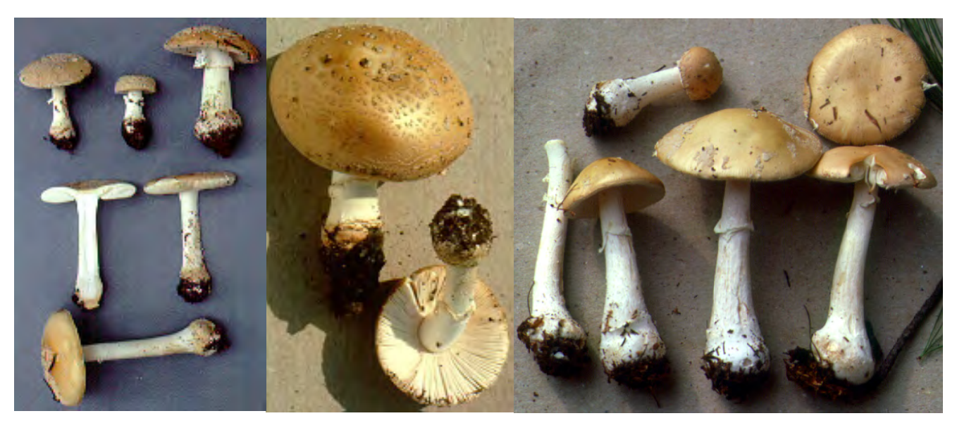
Fig. 6. Amanita crenulata. Ingestion can cause severe cases of the Pantherine syndrome. The small skirt-like ring on the stem often disappears. In fresh material, the top of the bubl on the base of the stem may have a thin coating of pale tannish powder as can be seen in the image on the left. Dry weather and a day's exposure to sun and air can produce changes in color and appearance.

of A. muscaria subsp. flavivolvata from the case of a puppy's poisoning in Pennsylvania. Marilyn Shaw (pers. corresp.) reported a case of a dog that, when out of doors and off the leash would rush to find A. muscaria subsp. flavivolvata and gobble the material down with the usual results; the behavior was only prevented by muzzling the dog. Wild animals also ingest this mushroom; RET has seen Gray Squirrels gathering mouthful after mouthful presumably for subsequent ingestion.