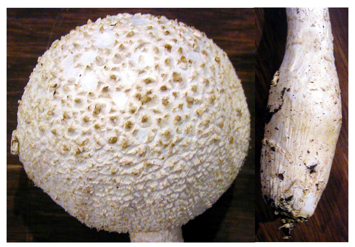
Fig. 4. Amanita rhopalopus . This species occurs in eastern North America. It is suspected of containing allenic norleucine because of its apparent, close relationship to A. smithiana . The top of the cap bears powdery remains of the mushroom's volva. The base of the stem ranges from a sausage-like shape (often tilted to one side in comparison with the vertical stem) to a top-like shape.