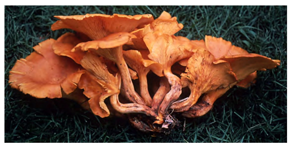
Fig. 11. Omphalotus illudens . Because the mushrooms grow from a common base arising in dead wood, this should never be mistaken for chanterelles (species of Cantharellus ) that grow separately (not from a common base) on the forest floor.

Clusters of fruiting bodies from one or a few common bases occur on old stumps. In contrast chanterelles with which Omphalotus species are sometimes confused (above) occur separated from one another and grow on the ground. The gills are always reported to be luminescent. RET has seen this only once after sitting with the mushroom in a closed closet in a dark room with a heavy blanket over the mushroom and the observer for 10 or 15 minutes.