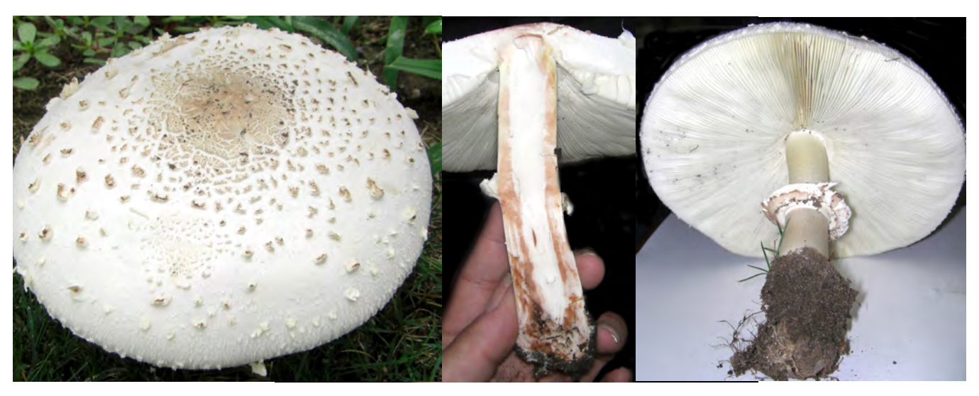
Fig. 8. Chlorophyllum molybdites. This mushroom is the most common cause of calls to NJPIES in which a person thought to have ingested mushrooms is symptomatic at the time of the call. Notice the ring around the stipe in the larger mushroom. If a cut is made across the stem, oxidation reactions cause color changes that begin with yellow or orange and progress to brown. When spores have formed on the gills, the gills are noticeably "dirty green." A spore deposit will be the same color. Obtaining a spore deposit before ingesting wild mushrooms would save a number of people per year a very unpleasant episode. Gills in older specimens may become a greenish dark gray.

Most distinctively, the spore print of the species is "olive green"; and, in mature specimens, the gills take on a strong "dirty green" tint.