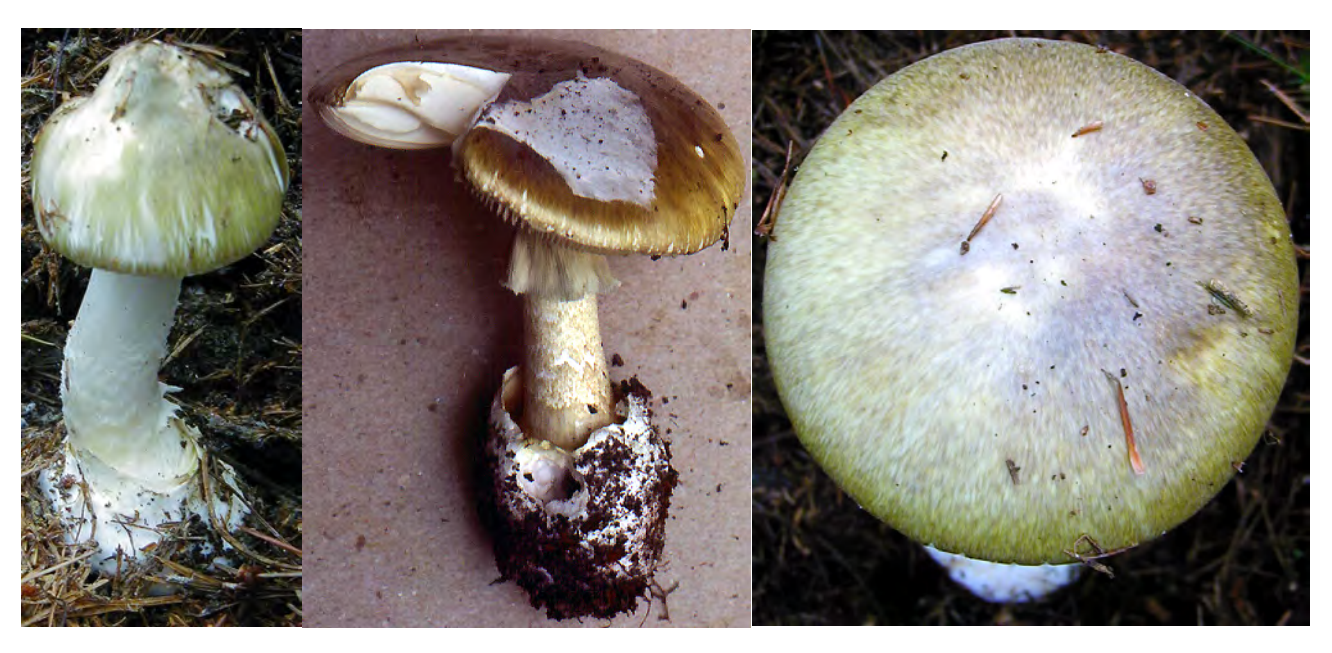
Fig. 2. Amanita phalloides. This species is the most common cause of death by mushroom poisoning in the areas where it occurs. It grows naturally in Europe and western Asia, but has been accidentally exported to both coasts of the U.S. and to many other countries on the roots of trees such as pines, oaks, some stock of nut orchards. It has been introduced in our region of interest in multiple locations, often in pine plantations established at about the time of the Great Depression. In our region, this species has not spread into native forest as it has on the U.S. Pacific Coast, where it is a significant public health hazard and possibly a hazard to the oak trees that it seems to prefer there.

http://www.amanitaceae.org/?Amanita+tenuifolia