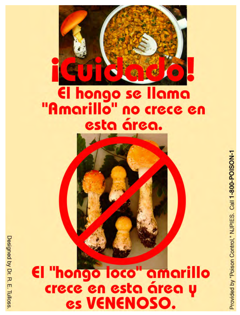
Fig. 7. Poster created after the a case of mushroom poisoning in a recent immigrant from Mexico caused by the yellow color variant of Amanita muscaria subsp. flavivolvata (el hongo loco amarillo) when it was mistaken for A. basii (el amarillo).

It should not be presumed that the biochemistry is identical in all cases in the following annotated list. In fact, with regard to mushrooms causing a gastrointestinal syndrome, the literature commonly states that while <u>some</u> possibly toxic compounds may have been found in <u>some</u> mushrooms of a given group, the knowledge is very incomplete; and the known compound(s) <u>may not be the cause(s)</u> of rapidly appearing gastrointestinal distress. Experiments on animals often involve injecting massive doses of a purified chemical. The human stomach and the human habit of cooking food produce a very different method of intake of mushroom chemicals, as Benjamin points out; so there seems no reason to be surprised that injections that kill mice do not always correlate to poisoning of humans who eat mushrooms containing the injected chemical.