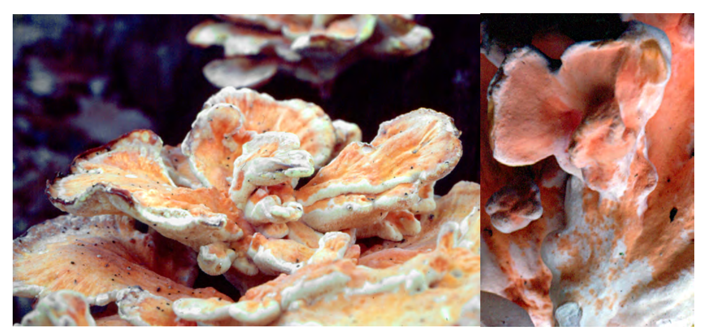
Fig. 10. Laetiporus . In our region of interest, the two most commonly collected species are considered edible. One of these has a white pore surface on the underside of its somewhat petal-like segments ( L. cincinnatus , left) and grows on the ground. The younger, parts of the fruiting body have a texture very much like that of white breast meat of chicken.

There are five species of Laetiporus in the U.S., some possibly unnamed as yet (Banik et al., 1998). The one that has been eaten the most frequently is the brilliant orange and yellow shelf-fungus, L. sulfureus .