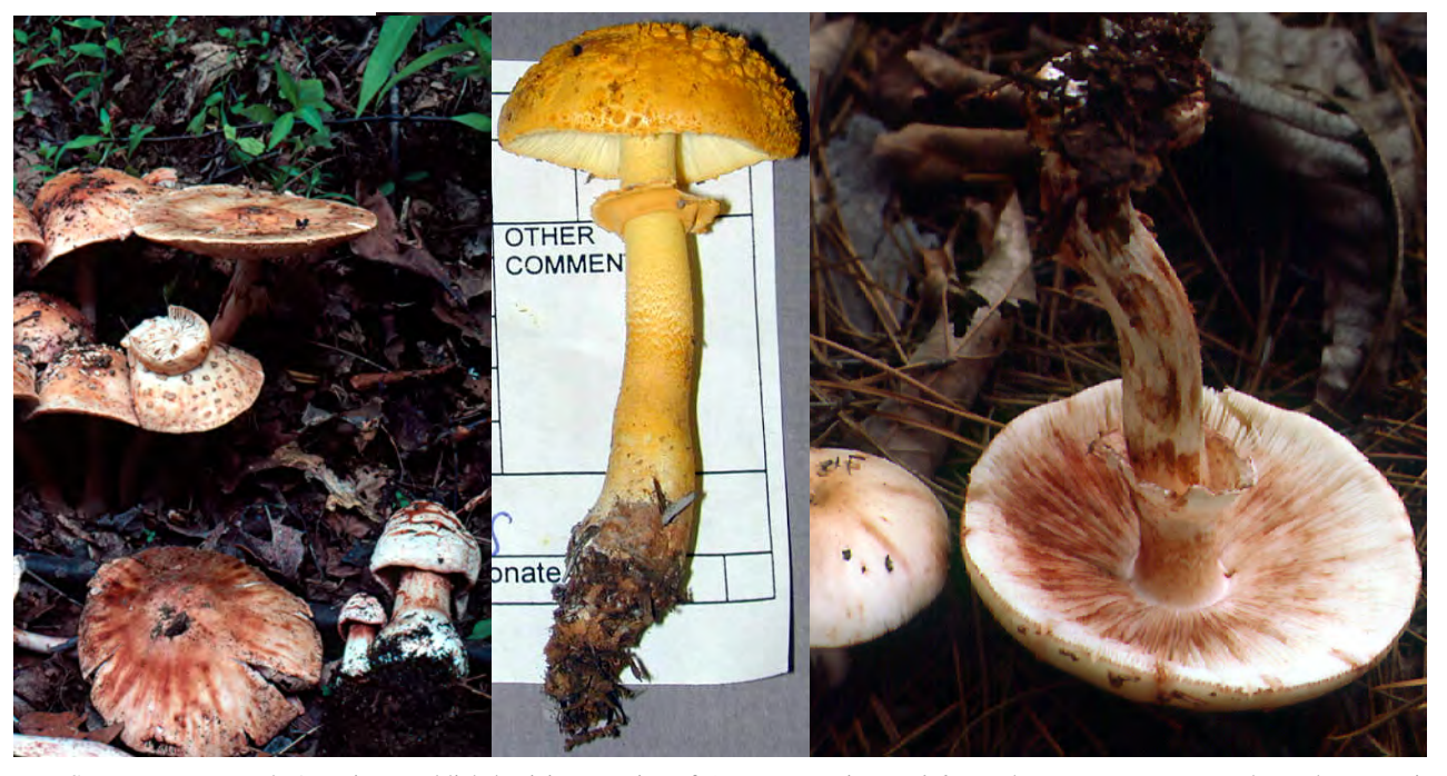
Fig. 9. Some eastern North American reddish-bruising species of Amanita section Validae . These taxa are among those that contain a hemolytic compound that causes the Gastrointestinal syndrome when eaten raw. Cooking destroys this compound. The [as yet to be named] species commonly called " Amanita rubescens " in our area of interest is depicted on the left. The central picture depicts A. flavorubens , and the rightmost image depicts A. rubescens var. alba .

Note: Poisoning frequency data for the region of interest is unknown. The species of Amanita section Validae that cause a Gastrointestinal syndrome when ingested raw are common in the region of interest. The gatrointestinal symptoms produced by such taxa as Amanita flavorubens , Amanita rubescens (in the sense of eastern North American authors), Amanita rubescens var. alba , and related taxa are thought to be produced by a hemolytic compound that is destroyed by cooking.